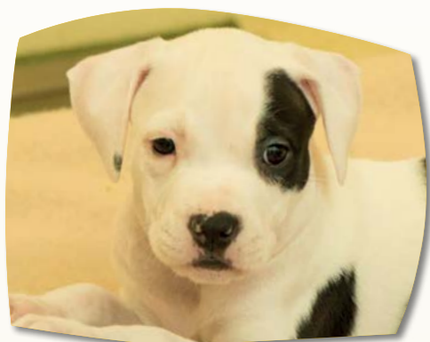
Baby Butch... born here at Dogs Trust

Thanks to Dogs Trust sponsors — caring people who pledge a little each